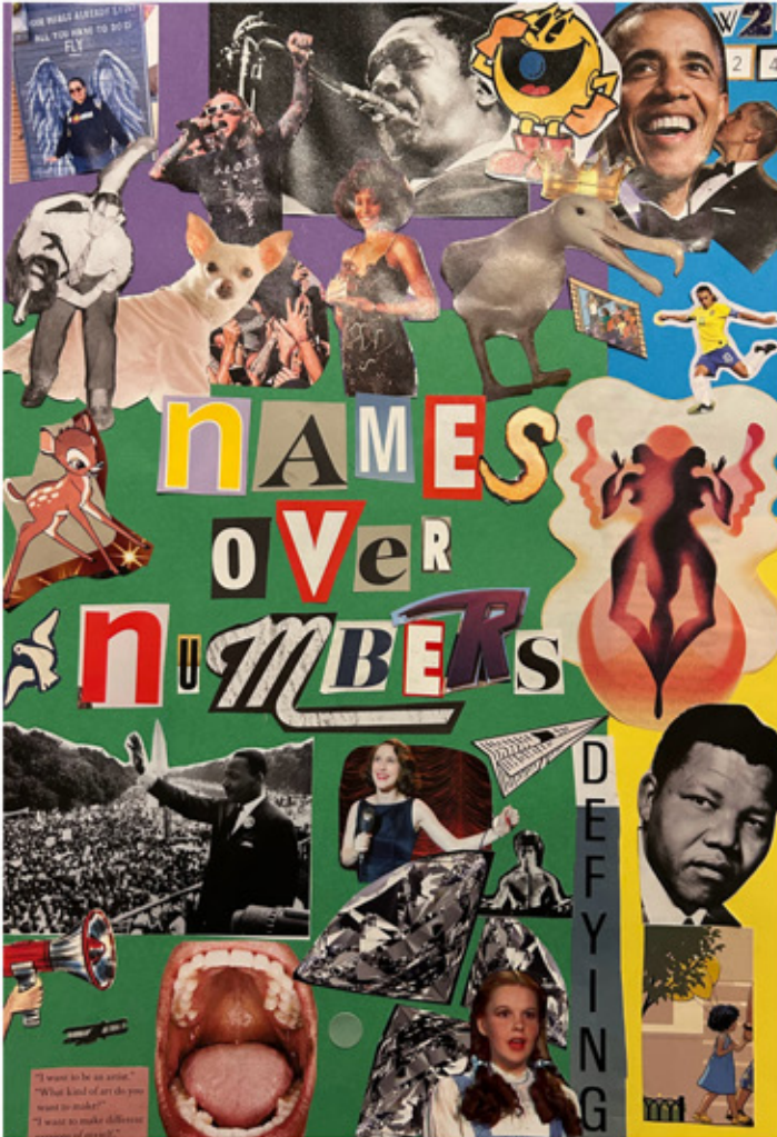
Art by entire class - each student contributed an image